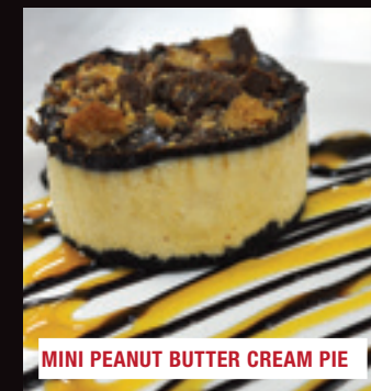
MINI PEANUT BUTTER CREAM PIE

Late Evening Start or end your night with Marino's great food & very reasonably priced drinks. After 9 pm all spirits (1 oz.), house wines (8 oz.) by the glass and all beers (12 oz.) $3 each. Available everyday until closing, with purchase of a meal.