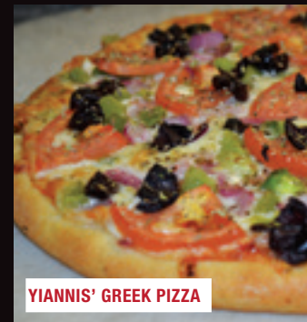
YIANNIS' GREEK PIZZA

Pasta Tuesday Buy one pasta at regular price and get the second of equal or lesser value at half price. Available for dine-in, take-out or delivery.