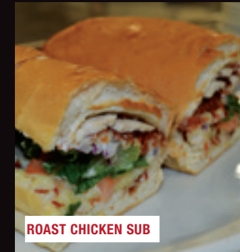
ROAST CHICKEN SUB

1/2 price Promo After 8 pm, buy any pizza or pasta and receive an equal or lesser value dish for half price. Sunday thru Thursday.