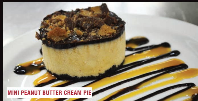
MINI PEANUT BUTTER CREAM PIE