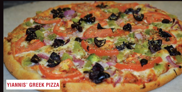
YIANNIS' GREEK PIZZA